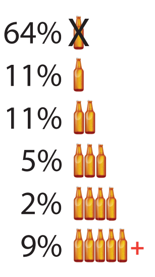
Figure 2. Yellow Medicine County 11<sup>th</sup> Graders Reporting How Much They Typically Drink at One Time (2016 MSS)

Past 30-day prescription drug misuse was reported by 4% of 8<sup>th</sup> graders, no 9<sup>th</sup> graders, and 3% of 11<sup>th</sup> graders in Yellow Medicine County in 2016. Specifically, in the past year, students in these grades combined reported the misuse of stimulants (0.5%); ADD or ADHD medication (0.9%); pain relievers (2.7%); and tranquilizers (0.5%).