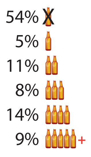
Figure 2. Wilkin County 11<sup>th</sup> Graders Reporting How Much They Typically Drink at One Time (2016 MSS)

Past 30-day prescription drug misuse was reported by 6% of 8<sup>th</sup> graders, 6% of 9<sup>th</sup> graders, and 3% of 11<sup>th</sup> graders in Wilkin County in 2016. Specifically, in the past year, students in these grades combined reported the misuse of stimulants (2.3%); ADD or ADHD medication (2.7%); pain relievers (5.0%); and tranquilizers (1.8%).