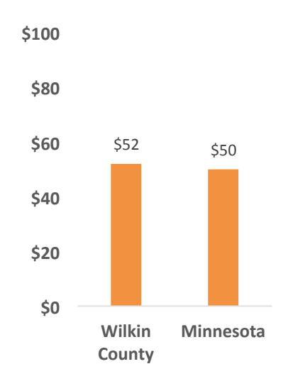
Figure 3. 2015 Cost per Capita of Alcohol Related Traffic Crashes, Fatalities, and Injuries (National Safety Council and Minnesota Crash Facts)